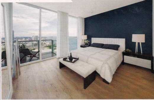
Brazilian Unit: Saccaro