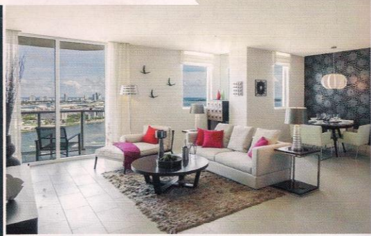
Venezuela Unit: Azul & Company