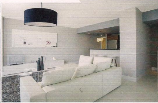
Colombian Unit: Carlos Polo